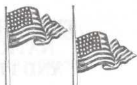
Figure 6. Flags displayed at full or half mast

G —When the flag is completely folded, only the blue field should be visible and it should be folded in the triangular shape of a cocked hat.